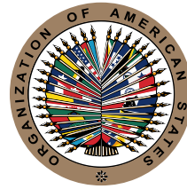
Organization of American States